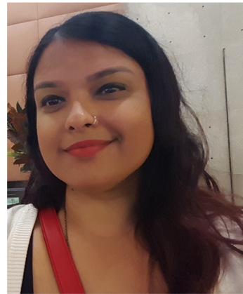
vs. Out in public